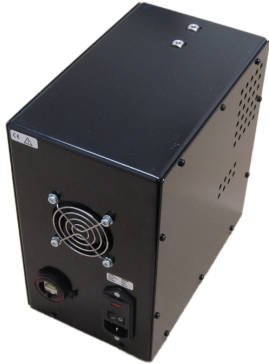
EL 2000 HS

The EL 2000 HS Series is a high speed modular DC load providing point of load (POL) connections and point of use (POU) for high slew rate DC loading. The EL 2000 HS is a stand alone load module for testing one device or group modules together for multi device testing. The smart on-board load head minimizes inductance, resistive losses and noise associated with typical loads that use wires to connect the device under test (DUT) to the load. With the increasing demand for high speed semiconductors, operating voltages are decreasing for minimizing the heat dissipation in devices. The EL 2000 HS is designed for sub 1V testing to meet the demands of low voltage devices.