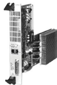
E2010 40A DC Load 721-0006

The Controller Module relays commands and information over the internal CAN bus to the Master Loads.