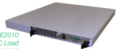
RE2010 40A DC Load 722-0006

Each Load in a rack system can be addressed individually, as each back plane PCB slot has a unique address.